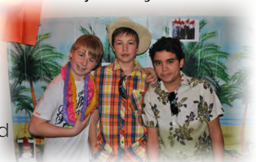
SCUDS in party mood